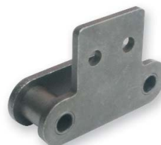
SA-2 1 Side, 2 Holes