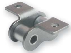
K-1 Both Sides, 1 Hole