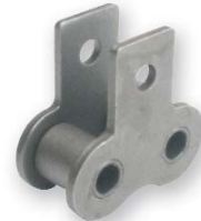
SK-1 Both Sides, 1 Hole