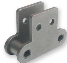
SK-2 Both Sides, 2 Holes