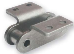
K-2 Both Sides, 2 Holes