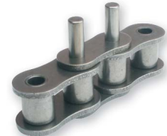
D-3 2 Extended Pins