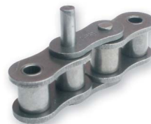
D-1 1 Extended Pin