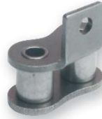
A-1 1 Side, 1 Hole