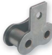
SA-1 1 Side, 1 Hole