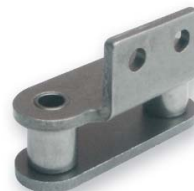
A-2 1 Side, 2 Holes